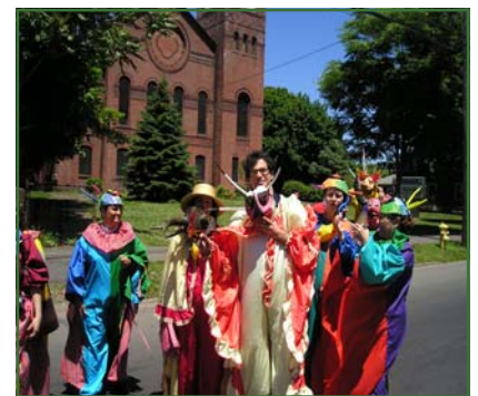
Puerto Rican masks at the Arts & Ideas Carnival 2004. Grand Avenue, Fair Haven.

In the last few years, JUNTA has been involved in a number of exciting arts-related activities. Recently, in addition to helping coordinate the Latino community's participation in the Arts & Ideas Carnival 2004, JUNTA and Arts & Ideas co-hosted a community workshop with Danny Hoch. Mr. Hoch is a globally acclaimed actor, hip-hop artist, writer and performer whose solo shows "Pot Melting", "Some People", and "Jails, Hospitals, Hip-Hop" have toured over 50 cities and won several awards. Mr. Hoch has also appeared in several movies, including "Thin Red line", "Black Hawk down" and "American splendor".