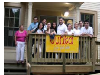
Event participants at JUNTA's back door.

looks forward to a continuing partnership.